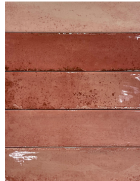
Coral 3"x12" HAL3X12CC