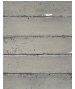
Grey 3"x12" HAL3X12CGY