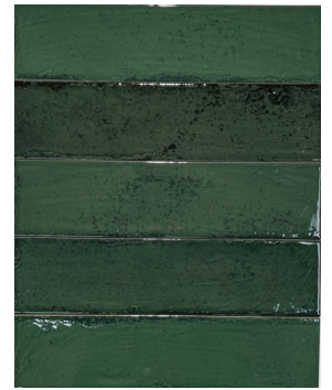
Green 3"x12" HAL3X12CGN