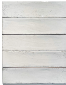
White 3"x12" HAL3X12CW