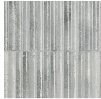
Ashen Gray HAL6X12KAG