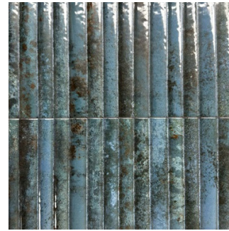
Ocean Blue HAL6X12KOB