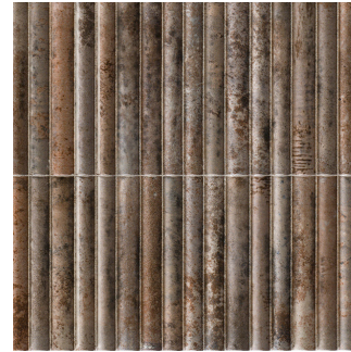
Earth Brown HAL6X12KEB