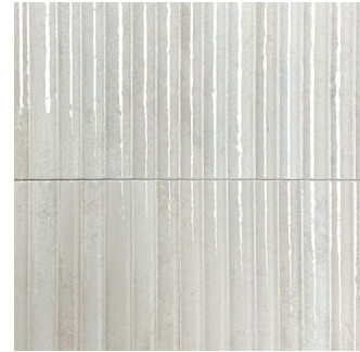
Soft White HAL6X12KSW